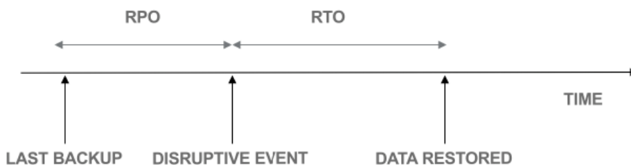
Figure 1 -1 Visual representation of RPO and RTO

RTO is the maximum loss of availability following a disruptive event measured by the maximum amount of time before the application fully recovers.